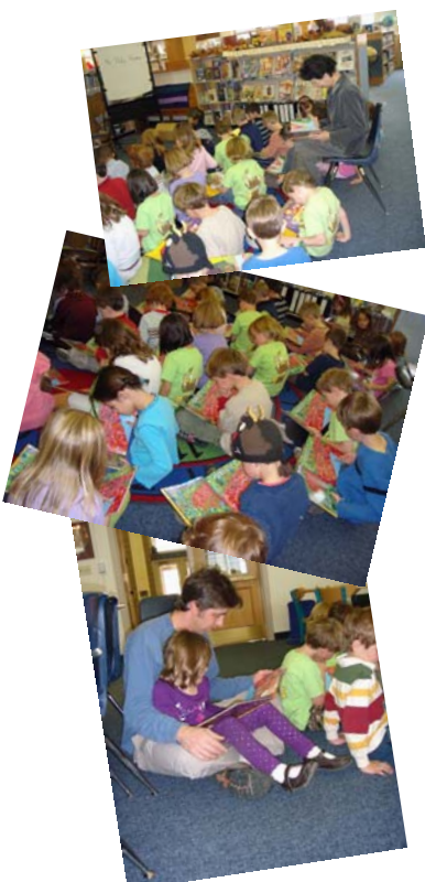
A local author visits 1st Grade